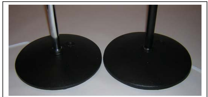
Heavy-duty cast iron bases for stability.