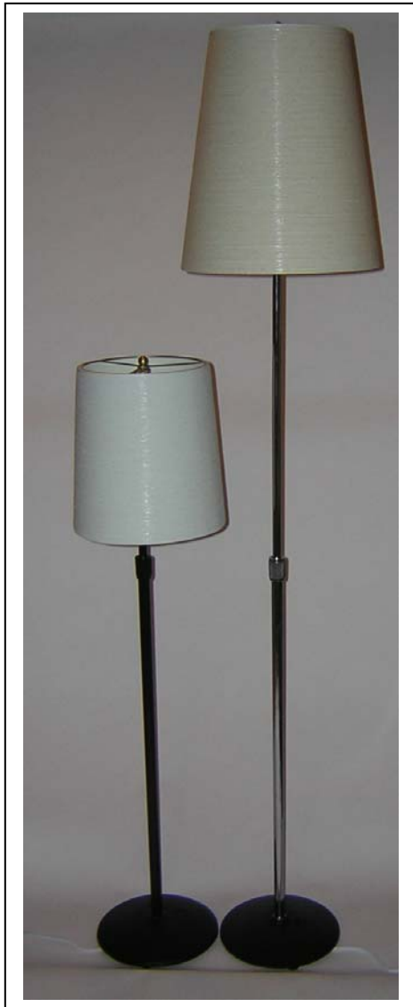
The long and the short of it.

Three way switches allow you to choose between low, medium, and high level illumination.