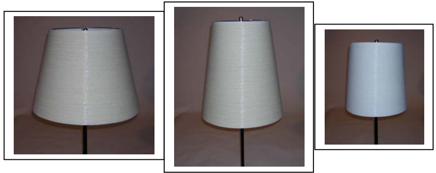
Your choice of three lampshades – (from left) M-II, C-II, G-I